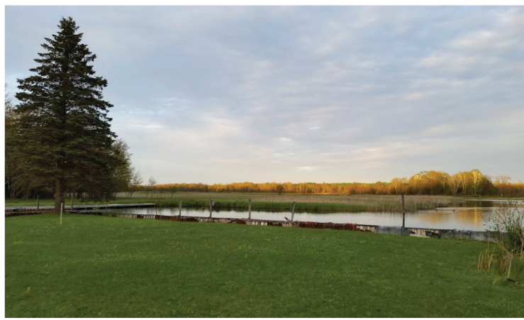
Late afternoon view at the site of the proposed new marina park.

WEB SITE: We are working on having all necessary information posted and regularly updated on a page dedicated to The Treasurer's Office. Thank you!